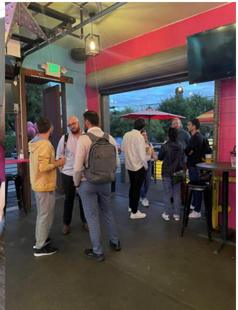
Enjoying a beer at Mujeres Brew House