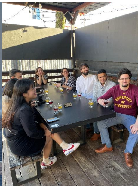
Walking tour participants sampling beer at Border X Brewing